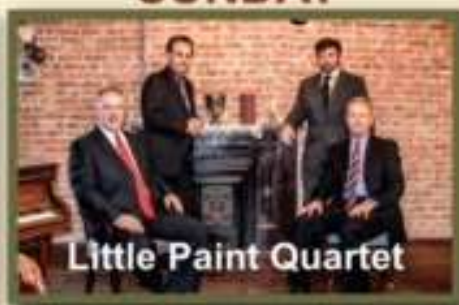
Little Paint Quartet