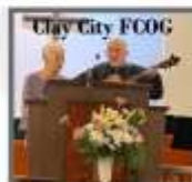
Clay City FCOG