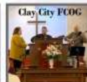
Clay City FCOG