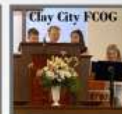
Clay City FCOG