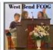
West Bend FCOG