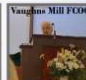
Vaughns Mill FCOG