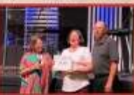
Betty Crabtree Memorial Award