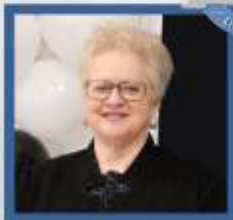
Portia Justice Secretary