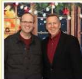
Worship Leader & East District Chairman