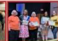
Regina Mulcahy History Book Awards