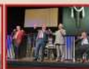
Fri. concert - The Townesmen